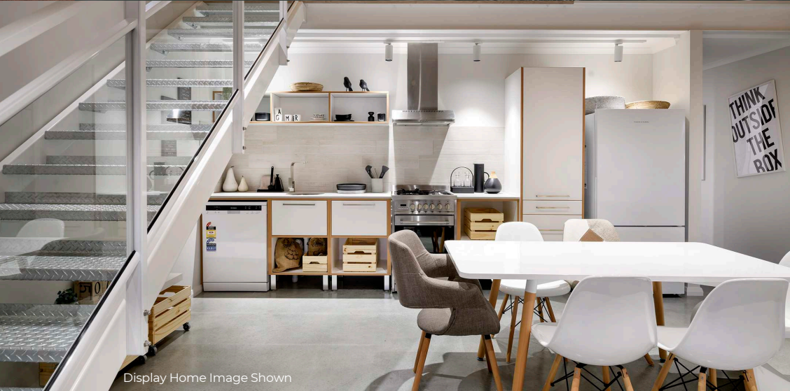
Display Home Image Shown